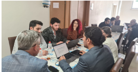
Workshop in BU